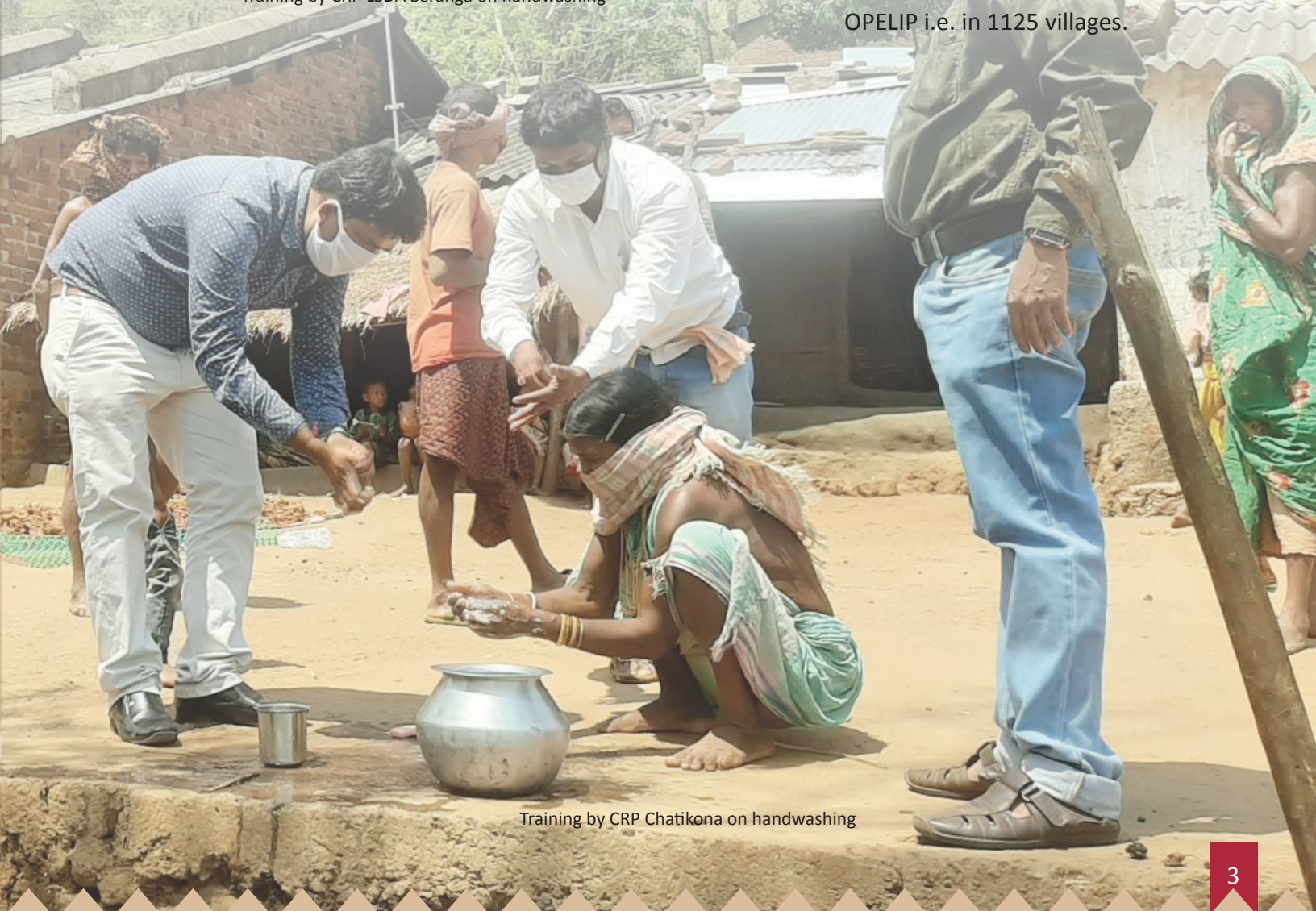
Training by CRP Chatikona on handwashing

This is the key elements to stop the spread of COVID-19. All the MPA staff including CRP/ VDC/SHG members and ASHA worker have been facilitating this practice along with the district administration directives across all programme villages of OPELIP i.e. in 1125 villages.