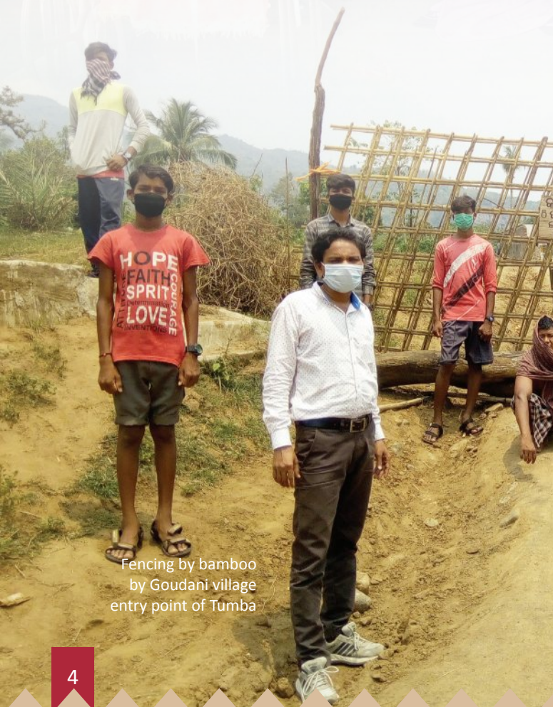
Fencing by bamboo by Goudani village entry point of Tumba

The VDC members of all programme villages in consultation with the villagers have blocked the entry & exit road of villages. This ensured that outside people were not allowed to get into the villages. Similarly, restrictions were imposed on vehicle movements to the villages. This gives a sense of security to the villagers that their areas will not be contaminated or affected due to COVID 19. All the villagers also followed the stringent norms set by themselves.