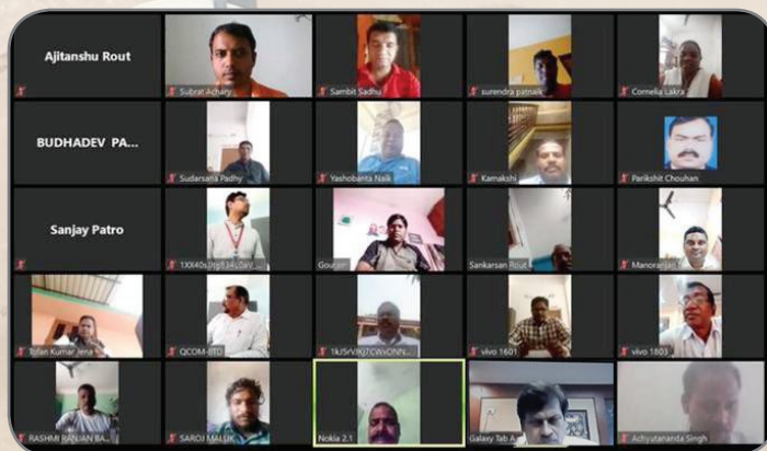
VC with MPA Staff on COVID 19 and programme review by Programme Director on 3 rd April, 2020