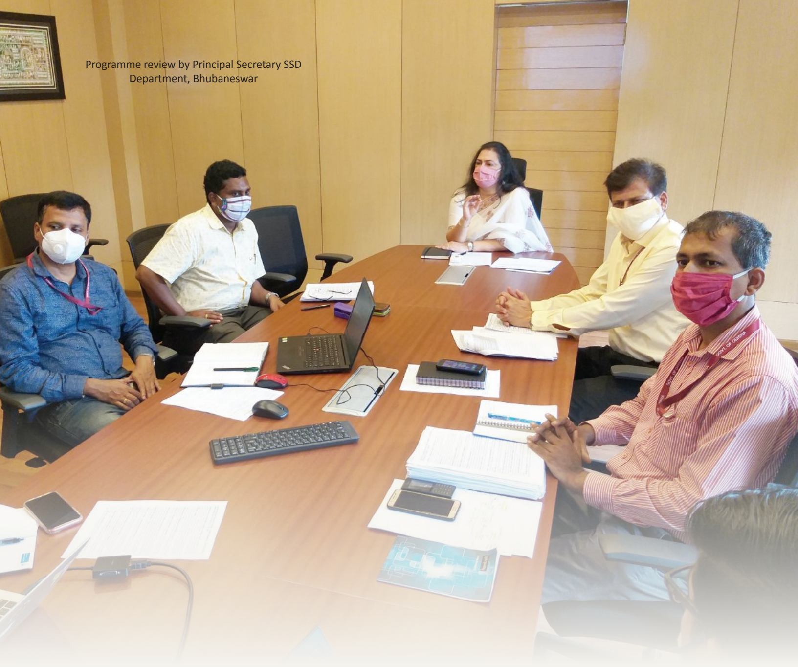
Programme review by Principal Secretary SSD Department, Bhubaneswar