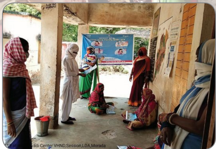
Sensitization during ANC, PNC on Covid-19, VHND Programme supported with male and female health workers, AWW, ASHA visited to HHs who returned from outside state to enquire their health.