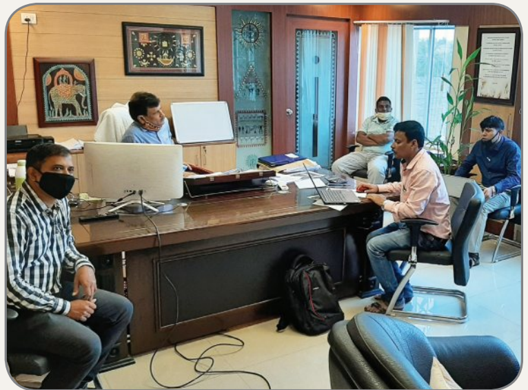
OPELIP Officials Headed By Programme Director attending Tripartite Portfolio Review Meeting (TPRM) Virtually Conducted by Dept. of Economic Affairs and IFAD