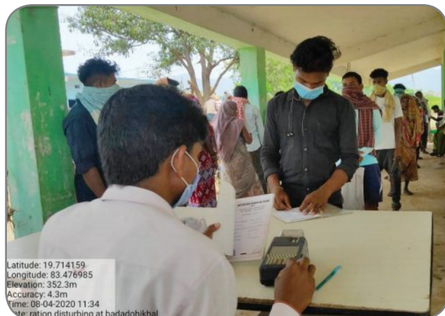
PDS distribution at Badadahikhal village of Chatikona MPA

PDS is a poverty alleviation programme and contributes towards the social welfare of the people. As per the govt. directives VDC members and CRPs are facilitating distribution of PDS items to the families.