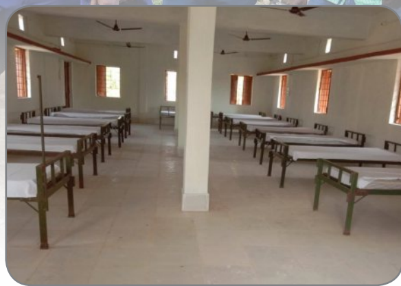
COVID19 Centre at Mundiguda of Mudulipada MPA

The VDC members of all programme villages in consultation with the villagers and instruction of the district administration arranged quarantine centre for people who have come from outside or sick person in the villages. Mostly migrant workers from outside were kept in the quarantine centres.