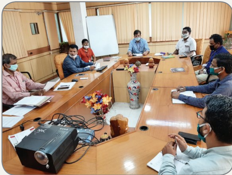
Staff review meeting by Programme Director at PMU, Bhubaneswar