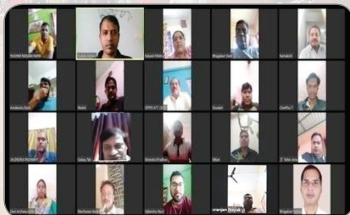
VC with PMU staff by Programme Director on 1 st April, 2020

Programme took steps to hold the review meeting with all stakeholders i.e with PMU staff by the Programme Director, secondly, Special Officer & Project Manager of MPA and thirdly, by IFAD, OPELIP. IFAD provided various kinds of technical guidance on fighting against COVID-19 i.e. on agriculture, migrant worker, social awareness building etc.