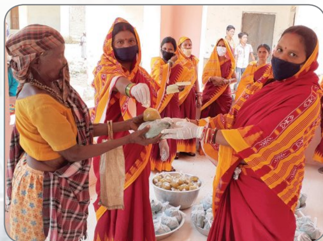
Maa Manekeswari SHG of Ajayagada village under Gumma Block, Gajapati district

Maa Manekeswari SHG of Ajayagada village under gumma Block, Gajapati district provide catering service in Ajayagada and also outside their village where no hotel facilities. During lock down period Maa Manekeswari SHG members provided free catering service for the needy people of Ajayagada, maintaining social distance and wearing mask at