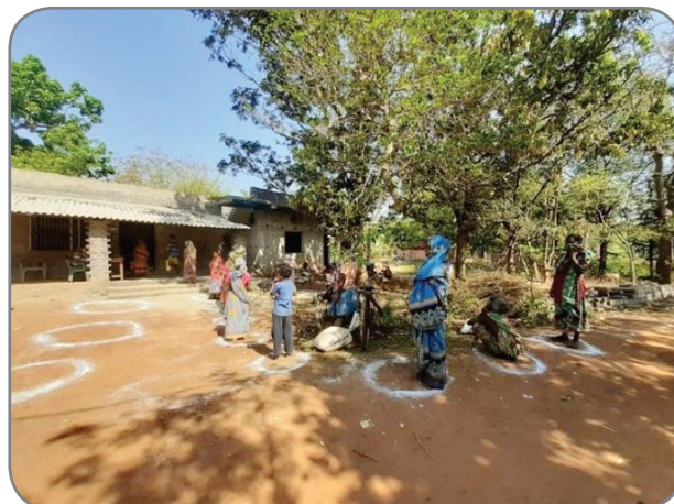
PDS distribution at PVTG village Bhadrasole of Moroda MPA