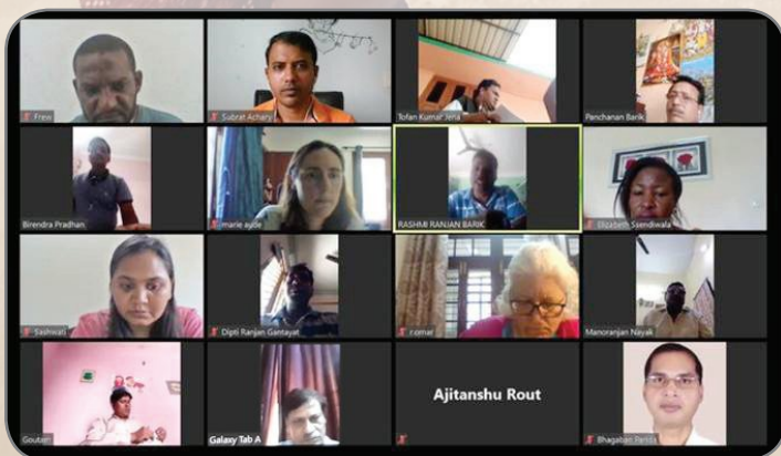
VC with IFAD Experts on 2 nd April, 2020