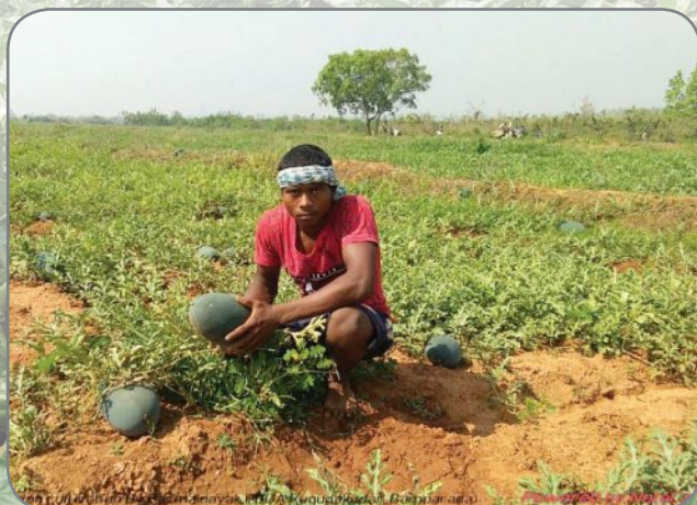
Harvesting Watermelon in Gurusang village under Rugadakudar MPA