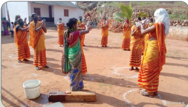
Training by CRP LSDA Seranga on handwashing

The programme has ensured sensitization to the community in the villages as per Govt. directives through CRP / VDC Members / SHG members with respect to mitigation of COVID 19 and ensuring Govt. entitlements to the eligible families. The details are as follows;